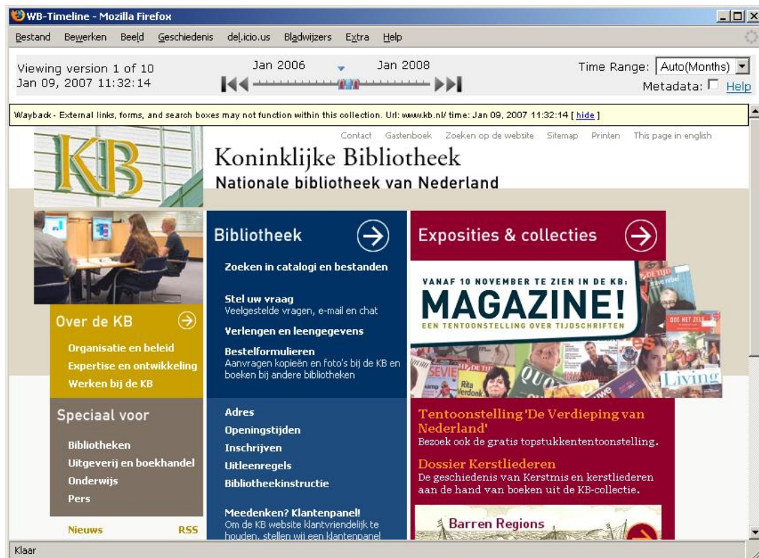
Figure 4. Time bar in reproduction of archived website.

To reproduce the archived website both search engines make use of the Wayback Machine, so that the reproduced site is the same for both search engines. At the top of the website is a time bar (using a beta version of the Wayback Machine) in which the user can see how many versions there are of the page in question and what date of this version is (see figure 4). There is also a timeline with arrows for going to the first, the previous, the next and the last version of the page. The versions are drawn on the timeline, the scale of which can be adapted according to hours, days, weeks, months and years. The user can click on the blocks that stand for the various versions. The user can also look into the metadata of the page in question.