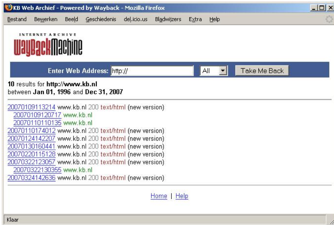
Figure 2. Wayback Machine search results

The search engine that searches by URL is the Wayback Machine (figure 1). This search engine has no other search function.